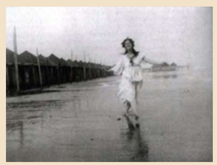
Isadora Duncan on the Lido circa 1903

Visit: www.idii.org/venice Call: (212) 753-0846 Write: info@idii.org